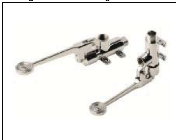
Immagine / Picture / Image

In accordo alla EN 9227 in merito all'aggressione salina According to EN 9227 regarding saline aggression Conformément à la norme EN9227 concernant l'agression saline